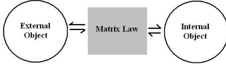
Figure2.3 Self-interaction between external and internal objects of a quantum entity

Figure 2.3 shows from another perspective of the relationship among external object, internal object and the self-acting and self-referential Matrix Law. According to our ontology, self-interactions (self-gravity) are quantum entanglement between the external object and the internal object.